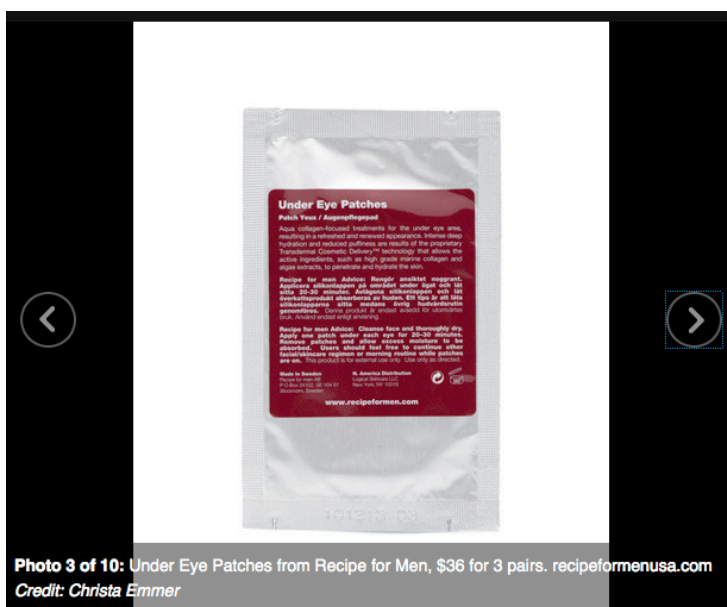
Photo 3 of 10: Under Eye Patches from Recipe for Men, $36 for 3 pairs. recipeformenusa.com

Therapy patches were front and center at the show this year. EyeSlices are reusable cryogel eye patches that soothe dark circles, redness and wrinkles. EyeSlices are made with whole leaf aloe and different instant cooling without being refrigerated. They come in a travel case so you can take them to work, the gym or anywhere your eyes need a treat. Available at